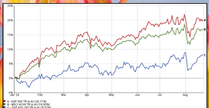
Share Market returns from 1 January to 23 August 2024